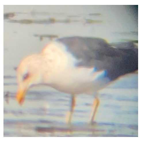
Lesser Black-backed Gull