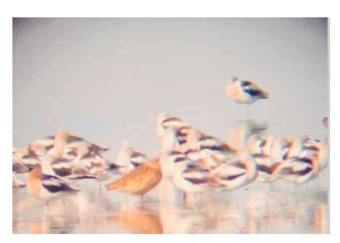
American Avocets, Marbled Godwit

After that we headed to Lee Kay. We stopped at the observation gazebo first and picked up a good number of species there. There were thousands of birds on the dump- starlings, blackbirds, ravens, crows, gulls, a Red-tailed Hawk, and even a Bald Eagle! The ponds weren't as full of ducks as I'd hoped but we picked out quite a few species including Northern Shoveler, American Wigeon, Ring-necked Ducks, Common Merganser, and one Red-breasted Merganser! Most of the folks in the group rounded out their 24 species with a Western Meadowlark. My car missed the meadowlark, but we picked up Brewer's Blackbirds and Dark-eyed Juncos on the way back out for our 24 species. It was a great trip and it was great to see everyone who came out to bird with us!