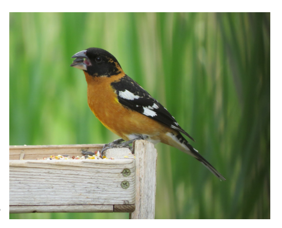
Male Black-headed Grosbeak

Pete Dunne describes their appearance as: "A medium-sized, massive-headed, gargantuan-billed songbird." What I like most about this bird is the color, I love the orange and black combination of the adult male. (Same colors, different combination of Spotted Towhee and Bullock's Oriole.)