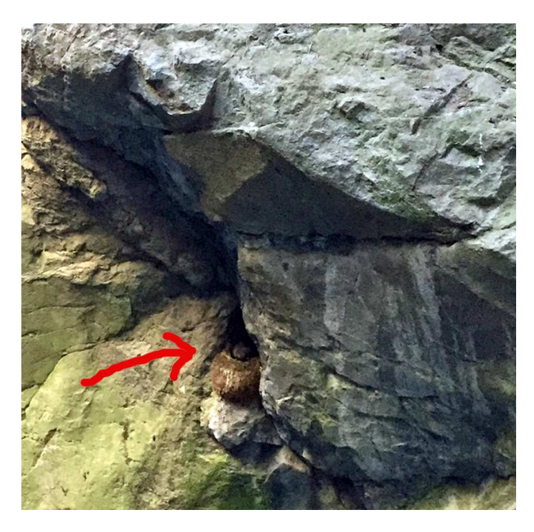
Black Swift and Nest at Box Canyon, Colorado