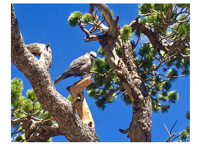
Loch Vale, Colorado