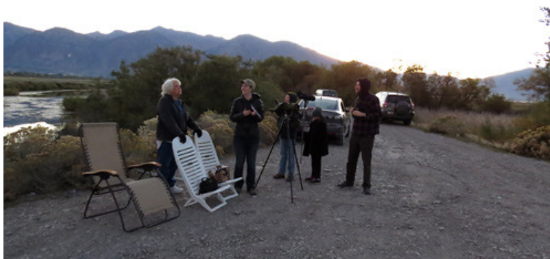
The Big Sit, Provo Airport Dike