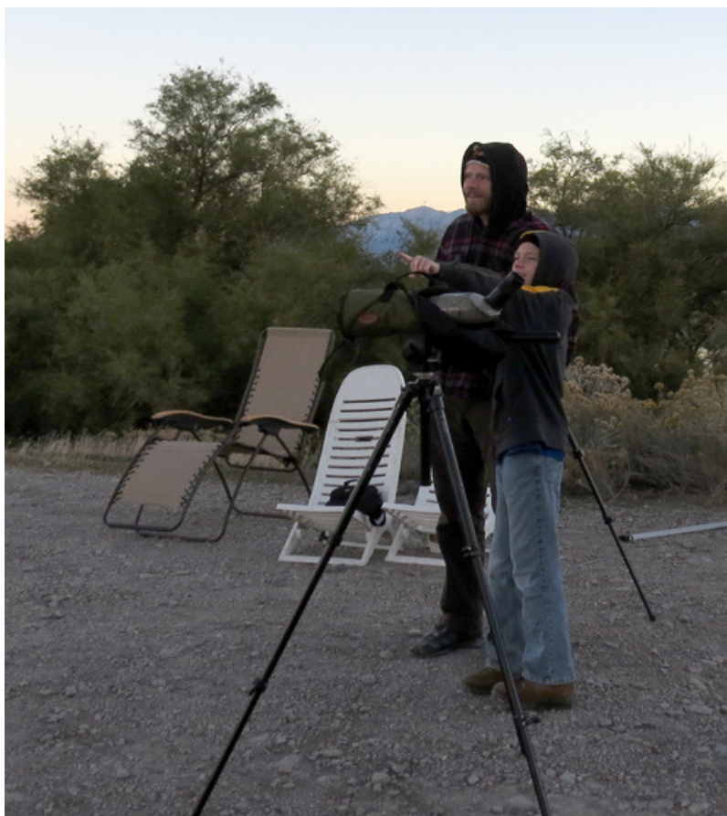
The Big Sit, Provo Airport Dike