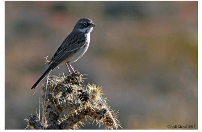
Sagebrush Sparrow East of Sand Hollow Reservoir

eyes on the vagrant Red-headed Woodpecker in the Pecan Grove in Hurricane, so we hurried over there to take a look. We were rewarded with great views. This woodpecker had been observed hanging around in the same area for several weeks and was in full color in a tree in the middle of the grove. A few of us also got brief looks at a Merlin in a tree along the south end of the pecan grove. That ended the field trip on a high note for the group.