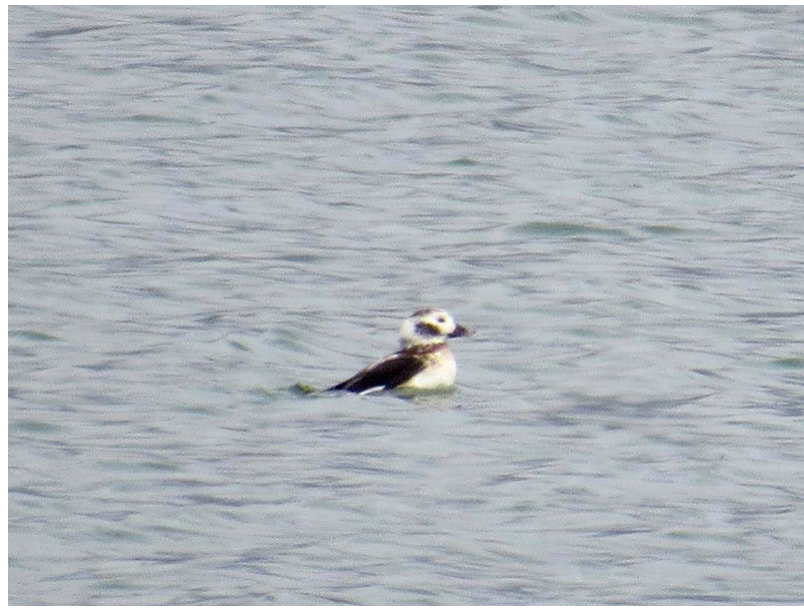
Long-tailed Duck - Santaquin

quite a few ducks out on the reservoir, but