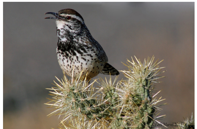
Cactus Wren East of Sand Hollow Reservoir

The weather started out breezy and cool on Saturday, but warmed up nicely later in the day. I joined the festival trip going to the reservoirs and fields in Hurricane, and got to see two of my target birds. Our first stop at Quail Creek Reservoir was pretty windy and cold, and didn't provide much to look at. Most of the birds were too far out on the reservoir, even for scopes, so we moved on to Grandpa's Fishing Pond in Hurricane. There we got great looks at Greater Scaup, a wide assortment of other duck species, and a Bald Eagle. Our next stop, the water treatment ponds, produced more ducks including Northern Shoveler and Bufflehead, a Mountain Chickadee, a Red-tailed Hawk, and some Western Meadowlarks. Following that stop we pulled into the State Park at Sand Hollow Reservoir. There we found a Loggerhead Shrike, a few more ducks and grebes, another Redtailed Hawk, and around the south end of the lake, a pair of Bald Eagles and a Prairie Falcon circling together in the sky. Our trip leader got a call from Rick Fridell at that point saying he had