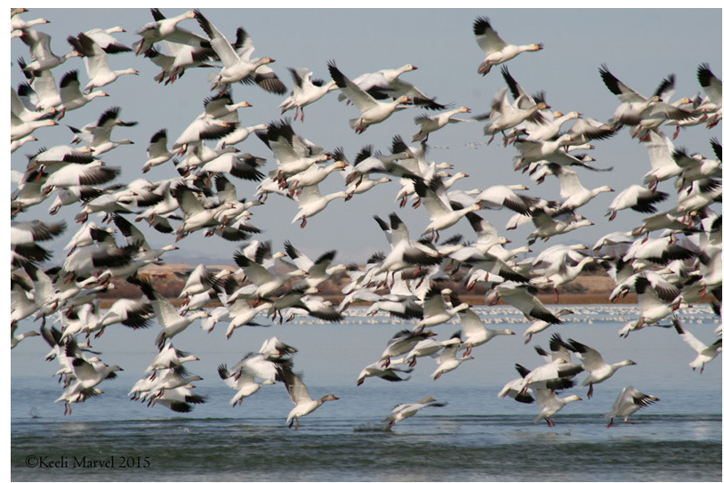
were waiting we located a Bald Eagle perched in snow Geese taking off from Gunnison Bend Reservoir. (2009 festival) a tree on the far side of the reservoir. There were

because of the distance and the snow, we were unable to identify them. The Snow Goose Festival organizers and the Utah Division of Wildlife Resources had a couple of tents set up for the event with a lot of educational information, festival t-shirts and other items for sale, and fun challenges for the kids. We got pretty good looks of the snow geese on the lake with our scopes, and lots of views of geese flying around the reservoir. Unfortunately because of the constant snow fall, and the distance of the birds out on the reservoir, we were unable to pick out any Ross's geese. The goose numbers were lower the weekend of the festival than they have been previous weeks. This was possibly due to the warmer weather we have been having encouraging the geese to migrate through the area a little earlier than usual.