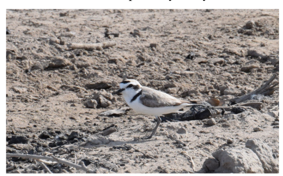
Snowy Plever