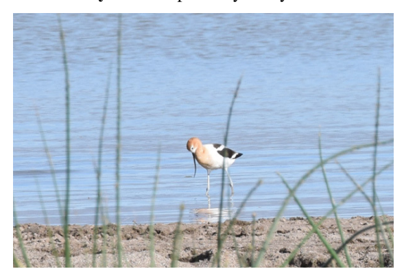
American Avocet - photo by Sheryl Serrano.