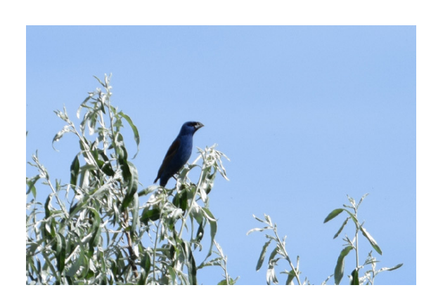
Blue Grosbeak