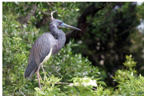
Fierce Tricolor