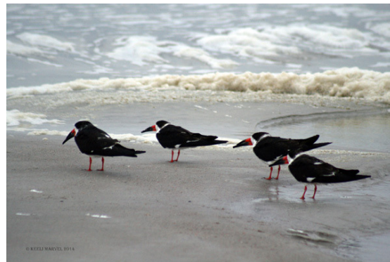
Black Skimmers

My second to last day in Florida I headed out first thing in the morning to chase eBird reports of Wood Stork and Painted Bunting. My first stop was a park called Blue Cypress Park where I picked up a lifer Brown Thrasher and a few more Palm Warblers. Next stop, out on the St. John's