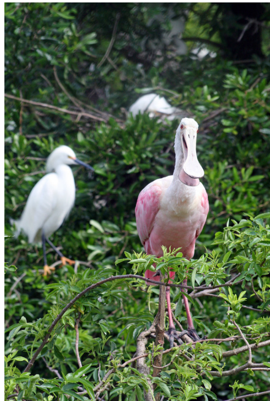
Chatty Spoonbill