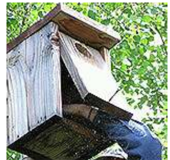
Wall swings open for cleaning

- Put 2 or 3 inches of wood chips in bottom of box and place box on pole or tree at least 10' high with an unobstructed flight path in front of entrance (no branches near the box).