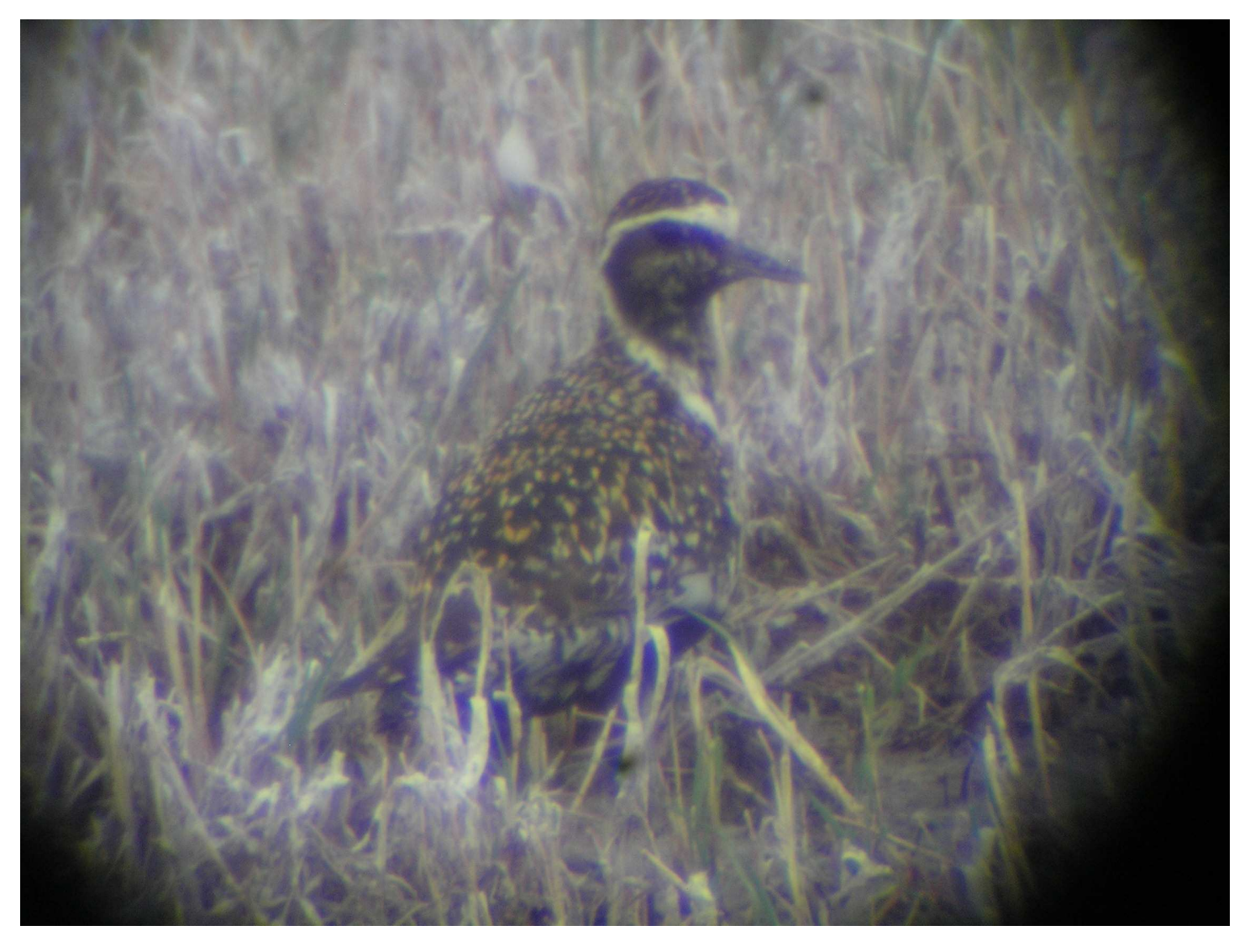
View showing the amount of white in undertail and vent areas and colorful back feathering. The very thin above eye line is also very obvious here.